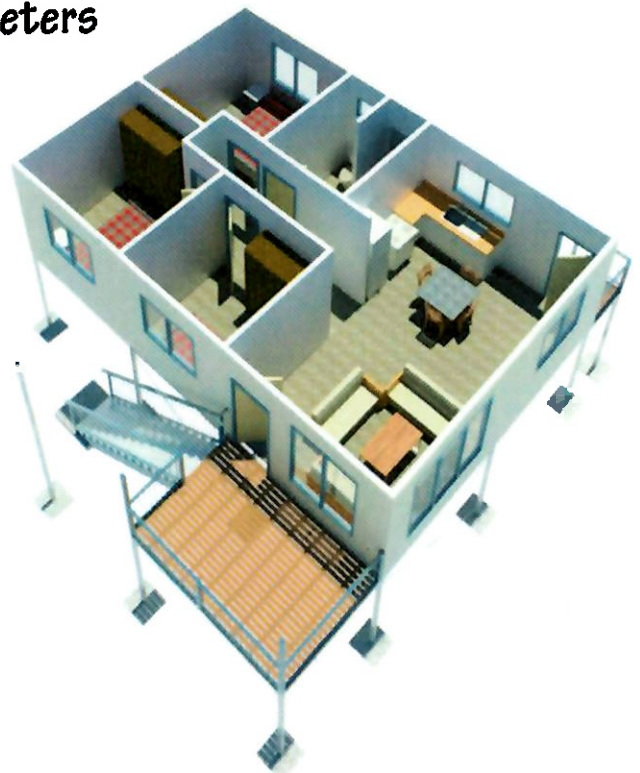
3D VIEW - INSIDE